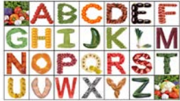
The Edible Alphabet

The Edible Alphabet. (2013, Smashwords) A unique way to teach the alphabet while introducing new foods. The graphic designs are made from foods representing each letter. Nutrition information is available for the highlighted foods. A visual design of MyPlate is included.